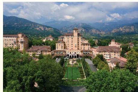
90th Annual Meeting July 29-August 1, 2026 The Broadmoor Colorado Springs, CO