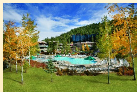
91st Annual Meeting August 4-7, 2027 Everline Lake Tahoe Olympic Valley, CA